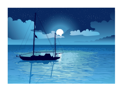
Vocation is the spine of life -Friedrich Nietzsche