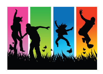
Character is fate. - Heraclitus