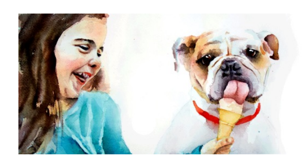
"The kind man feeds his beast before sitting down to dinner." - "Hebrew Prophet