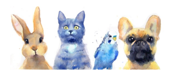
""Lots of people talk to animals.... Not very many listen, though.... That's the problem." - "Benjamin Hoff, The Tao of Pooh